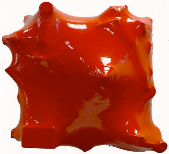
Cameron Luft- 2011 Krylon